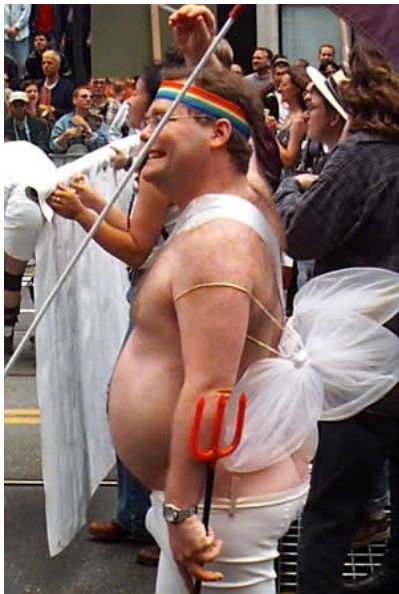
Is this what they mean when they say Gay Pride?

Preachers are often quoting 2 Chronicles 7:14 and presenting it as the solution for our national calamity. I would like everyone to read it again.