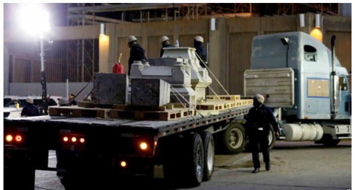
Removing the Robert E Lee Monument - New Orleans

Give to the Christian Research & Development Center Give to our children's future!