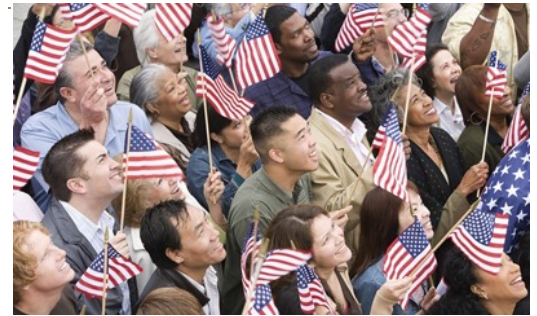
America's new immigrants are majority non-white.

The main reason for the growth of this nationalism, both here and in Europe is the unfettered invasion of nonwhites into our homeland