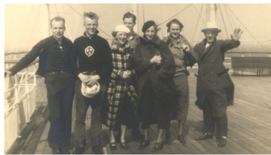
Danish immigrants arrive at Ellis Island

White people are afraid to say anything that sounds racial and are intimidated into silence while our country is flooded with aliens