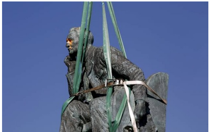
The removal of the Cecil Rhodes Monument from the campus of the University of Cape Town - South Africa.