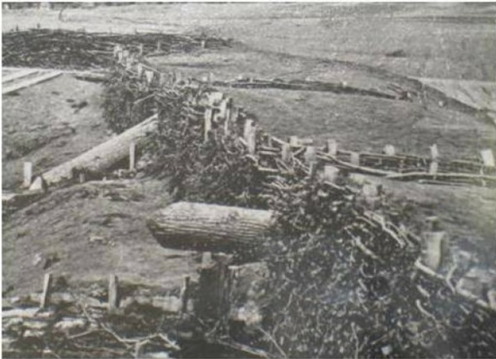
Confederate Quaker Cannons at Centerville, Va in March of 1862 gives the impression of greater strength than they actually had.

of a cannon. On December 4, 1780-the Americans were able to trap about 125 British soldiers who took refuge in a home and barn near Camden, South Carolina. Col William Washington - surrounded the house - used logs as a fake cannon and forced their surrender.