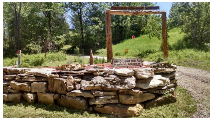
The beautiful entrance to the Christian Revival Center

Our countrymen in 1776 well knew how important their faithfulness was to the nation. And because of their faithfulness the soil of America was made holy with every drop of blood spilt from their veins.