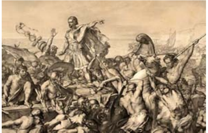
The Gallic Wars: Europeans fighting Europeans - 50+ years before Christianity.

While it is popular among those that hate Christianity to blame the Christian faith for being responsible for the deaths of millions in religious wars, the fact is war